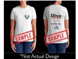
*Not Actual Design

Sponsors will receive recognition of their name/logo on SAYVA Ambassador T-shirts + recognition as a sponsor on our website. This is perfect for individual family sponsorships.